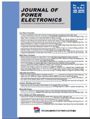
(a) Front cover.