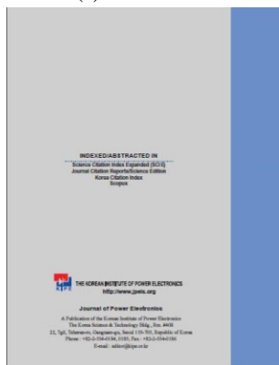
(b) Back cover.